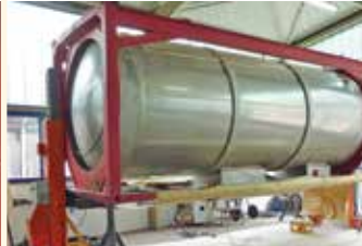
ISO Tank Applicator