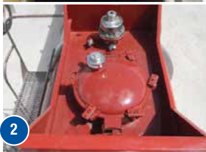
1) Interior pitted OTR tank with corrosion prior to ChemLine® application, and then coated with protective ChemLine®. 2) Manway lid showing corroded rubber lining, due to HCL exposure, and manway lid and surrounding spill area then properly protected with ChemLine® coating. 3) ChemLine® coating application.