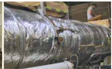
OTR Tank Applicator