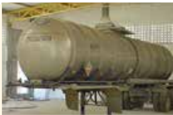
Oilfield/ Frac Tankers