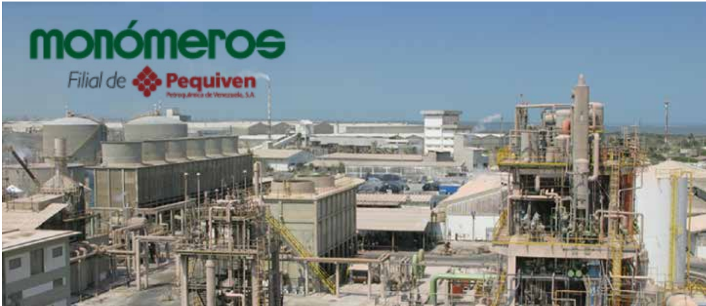
Monómeros Colombo Venezolanos' facility in Barranquilla, located on the north coast of Colombia.

Several tanks at this tank terminal storage facility in Barranquilla, located on the north coast of Colombia, required special tank lining protection to handle corrosive Sulphuric Acid.