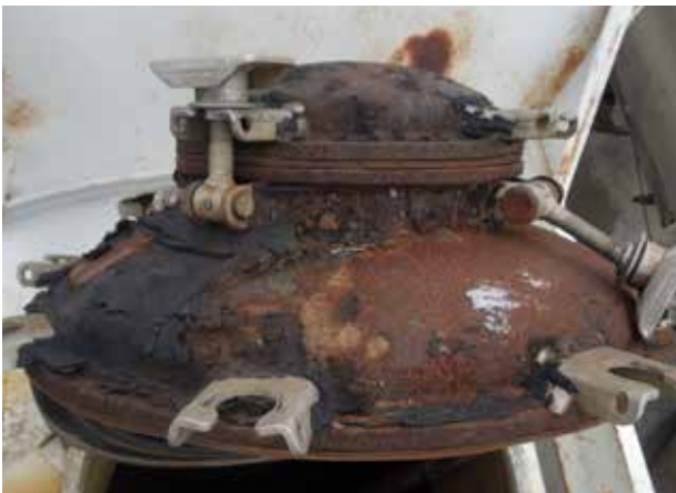
(Above) Manway lid showing corroded rubber lining, due to HCl exposure. (Below) Manway lid and surrounding spill area properly protected with ChemLine® coating.

Other drawbacks to rubber linings are 1) they are costly to install and must be applied only under ideal conditions;